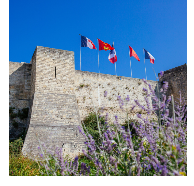
The Castle of Caen