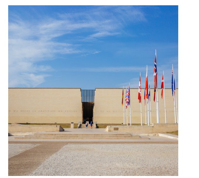
The Mémorial Museum