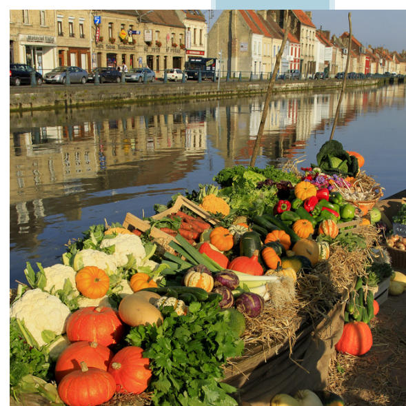
SAINT OMER MARKET

www.visitkent.co.uk & www.pas-de-calais-tourisme.com