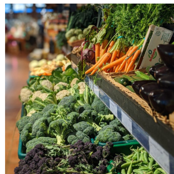
MACKNADES FINE FOODS