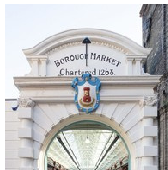
GRAVESEND BOROUGH MARKET