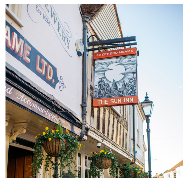
THE SUN INN, FAVERSHAM

www.visitkent.co.uk/visit-kent-blog/north-kent/